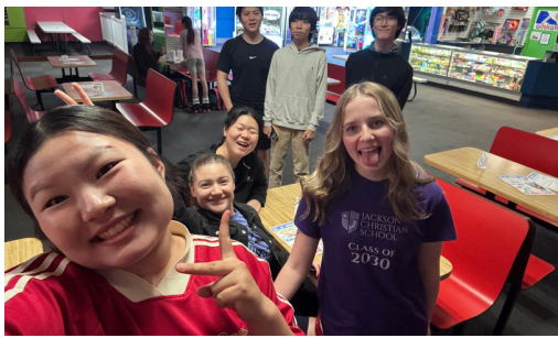
Laser Tag in April!