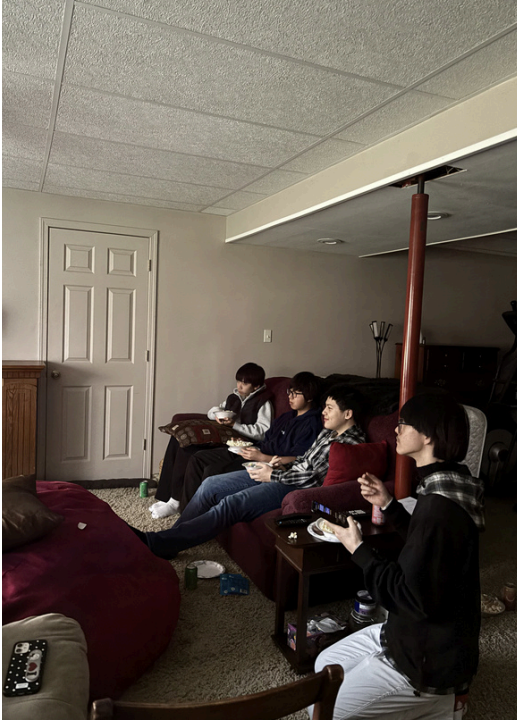
Students enjoyed a popcorn and movie night together in March.